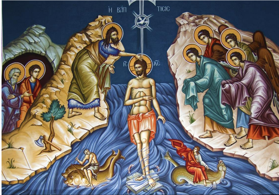
The Baptism of Christ